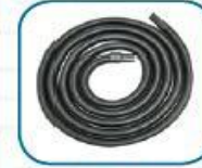
80-0503 25 ft. Vacuum Hose with Cuffs Assembly

SNIPER CARPET EXTRACTOR 12-Gallon Carpet Extractor Series