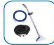
80-0500 Hoses and Wand Kit