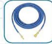
80-0502 25 ft. Solution Hose Assembly